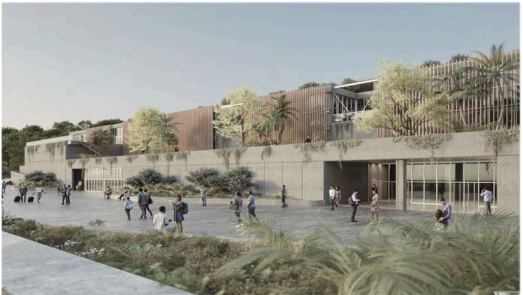
Prime Creative Arts Center. The laboratory and schools block